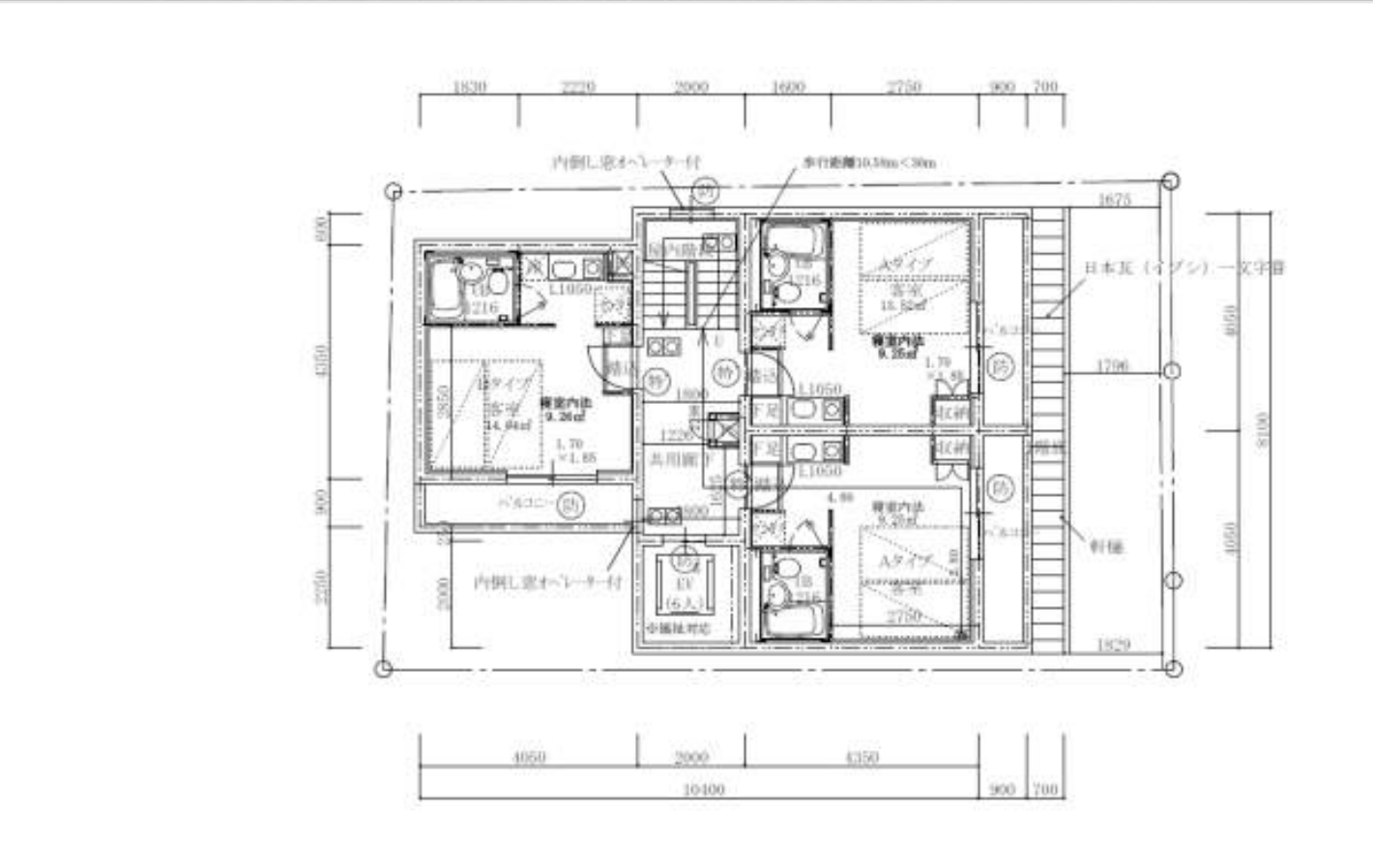
2<sup>nd</sup> and 3rd Floor Layout