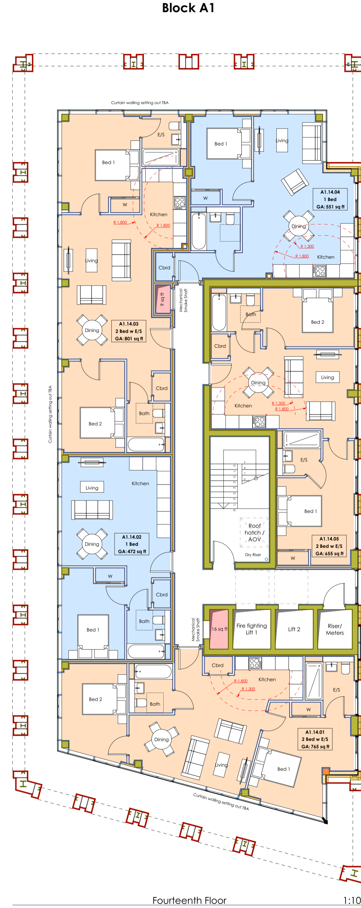
Fourteenth Floor 1:100