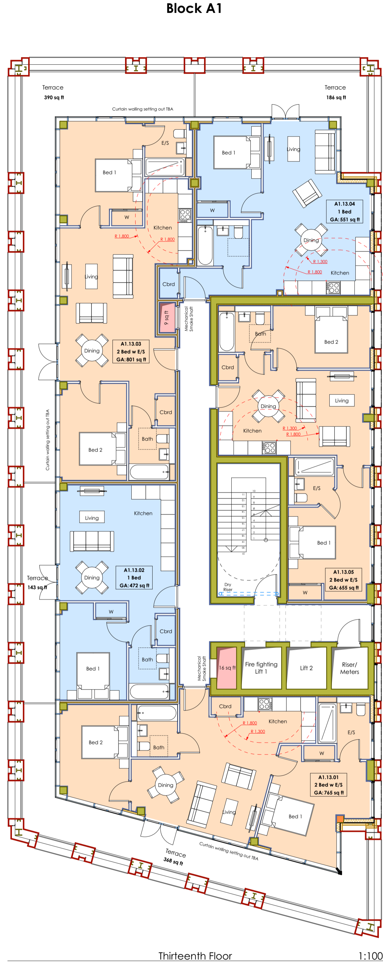
Thirteenth Floor 1:100